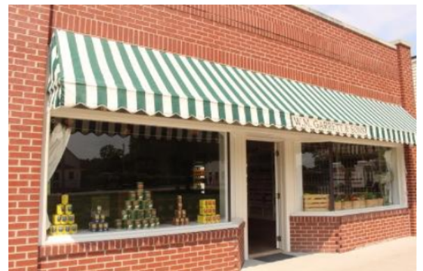
Garrett's Grocery Store

A replica now stands in Shawnee Town 1929. Fully stocked and ready for your enjoyment. Go to Home - Shawnee Town Museum to plan your visit.